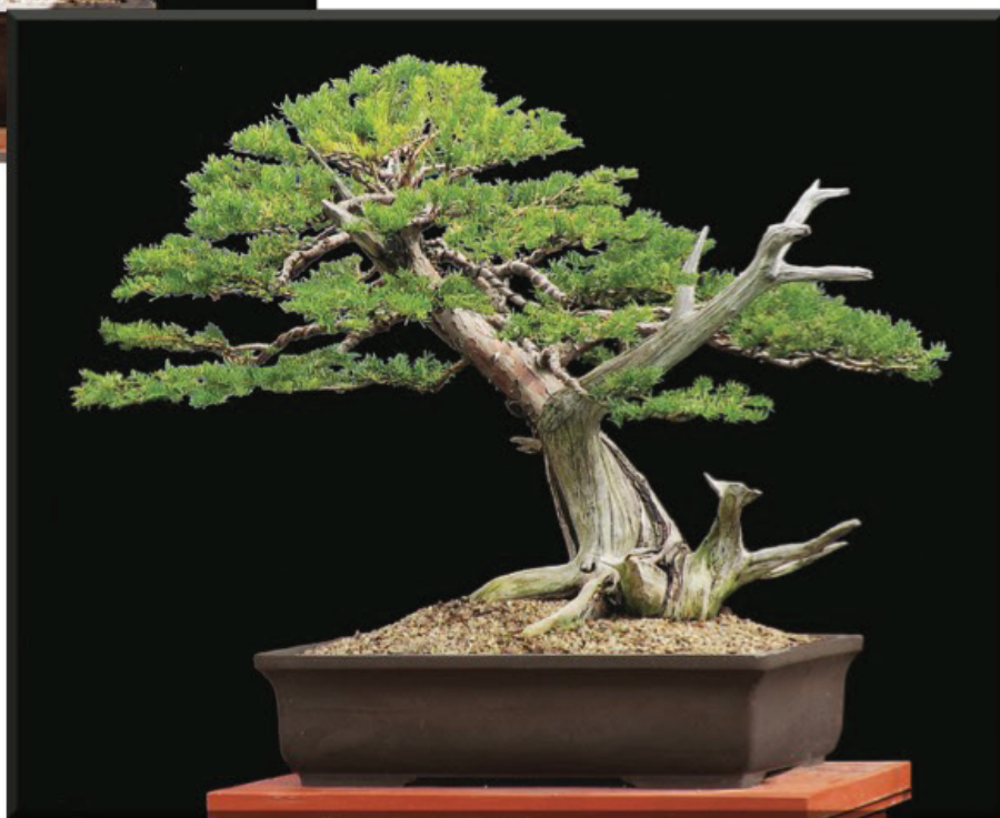
June 30th of 2017