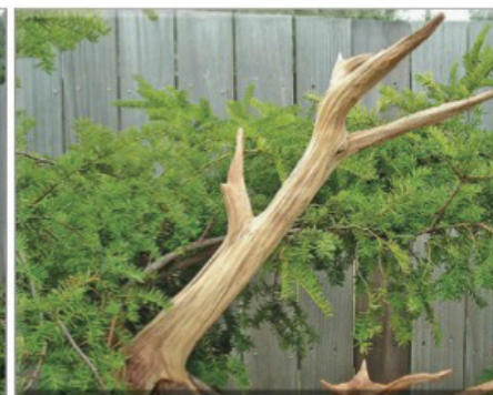
Close-up of Jin