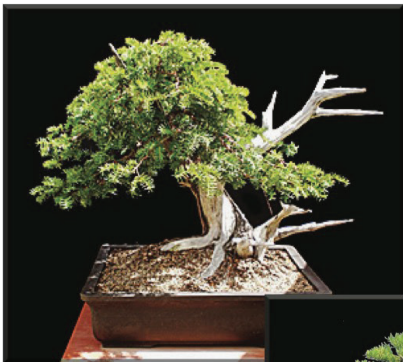
August of 2009

A fter getting its bonsai pot in August of 2009, the Yew has had several re-stylings in the subsequent 8 years. Pictured below compares how it looked when placed in a bonsai pot for the first time and how it looked on June 30th of 2017, just after it was trimmed & wired once again.